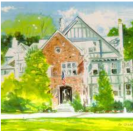
Woman's Club of Greenwich