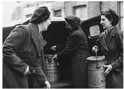
This photograph depicts members of a London WVS centre, in 1947, loading pails containing individually portioned Meals on Wheels onto a delivery van.

In Greenwich, MOW began in 1960 by The Woman's Club. They started with two meals a day on Tuesdays and Thursdays, including a hot dinner and a cold protein. Projects to help pay for the MOW service at the time included sales of books, toys, costume jewelry, and fruit cake. In 1962, MOW made over 1,600 deliveries to customers. Today, MOW delivers over 2,156 meals per month to Greenwich residents, both old and young.